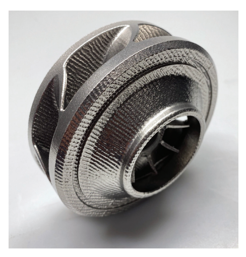
Ni625 Printed Impeller Industrial impeller printed using 6K Additive plasma spheriodized powder at Sintavia on an EOS M290 L-PBF system.

At 6K Additive our powders are produced from sustainable sources including used powders and machine turnings. We leverage these input streams as feedstock for the UniMelt process, essentially turning scrap into high value AM powder. This process enables your organization to get value back from your past powder investment by participating in 6K Additive's powder buy-back program. We will buy your used powder, provide you a credit towards new premium powder for a wide variety of applications.