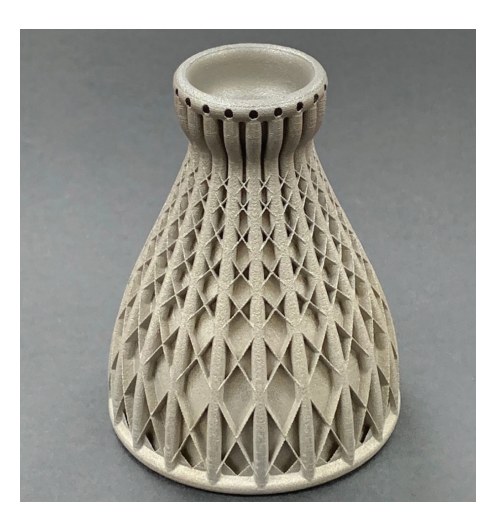
Ni718 Printed Rocket Nozzle Printed using 6K Additive plasma spheroidized powders at Castheon on a Concept Laser M2 printer.

At 6K Additive our powders are produced from sustainable sources including used powders and machine turnings. We leverage these input streams as feedstock for the UniMelt process, essentially turning scrap into high value AM powder. This process enables your organization to get value back from your past powder investment by participating in 6K Additive's powder buy-back program. We will buy your used powder, provide you a credit towards new premium powder for a wide variety of applications.